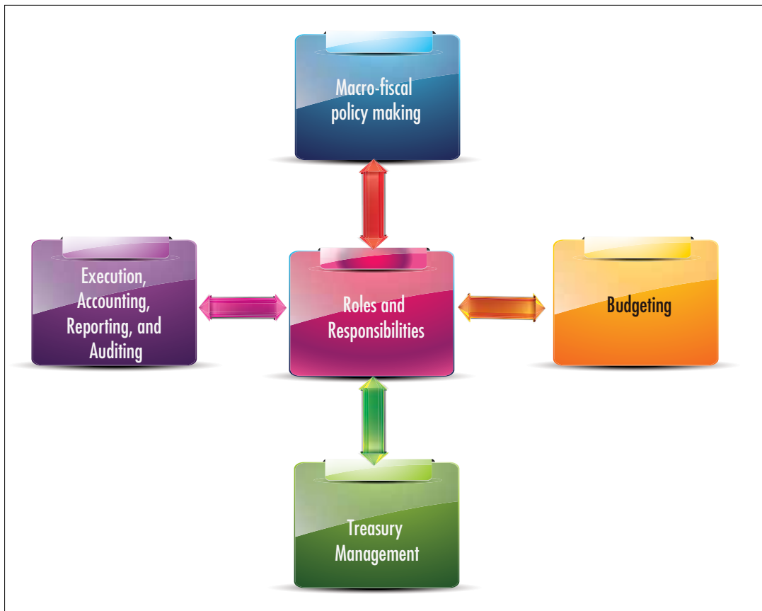
Figure 1: Five core areas of a good PFM system

The main objective of the Act is to ensure that national and county governments manage public finances in accordance with the principles spelt out in Article 201 of the Constitution, and that public officer's account to the public through Parliament and county assemblies. The PFM Act outlines a new budget calendar with clear deadlines, and clarifies the roles and responsibilities of the various stakeholders. The Act also introduces new PFM reforms, such as a Single Treasury Account, which will have far reaching implications on public finance management.